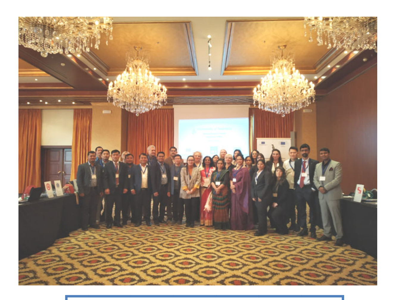
All participants of the First Study Visit in Ioannina Greece consisting of participants from Greece, India, China, Cambodia and Luxembourg