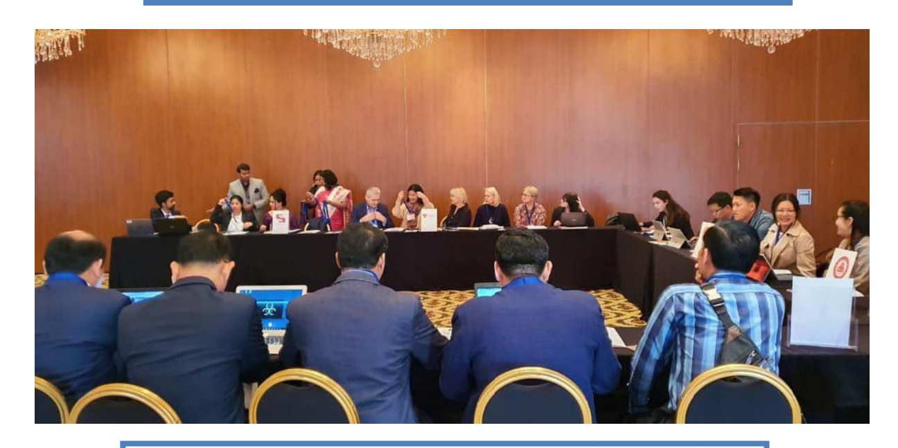
Deliberations among all participants of the First Study Visit in Ioannina Greece